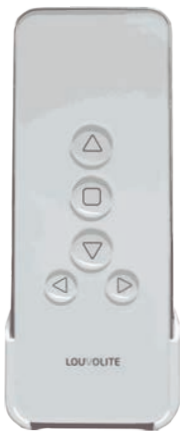
5 Channel Remote Control

The Lithium 1100 series benefits from complete ease of use and economical maintenance with its rechargeable battery. The sleek remote quietly and conveniently controls up to 5 blinds from anywhere in the room. This luxurious motorised solution has the capacity to operate wider blinds up to 2.5m wide and 2.9m drop.