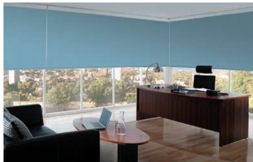
Remote control operation

The modern A/C remote control can operate up to a remarkable 15 blinds.