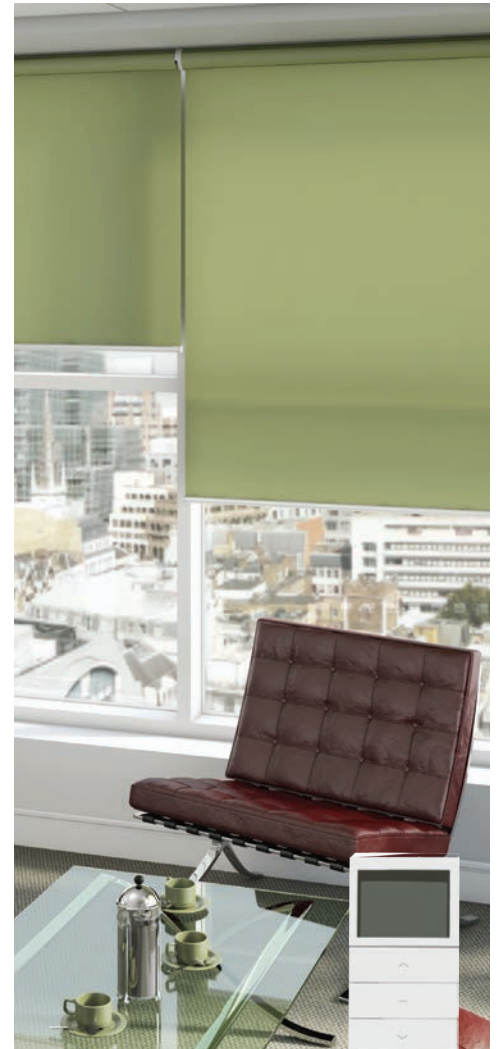
15 Channel Remote Control