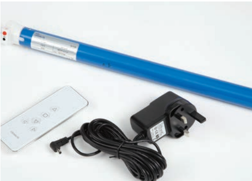
Lithium 1100 series motor with remote control and charger