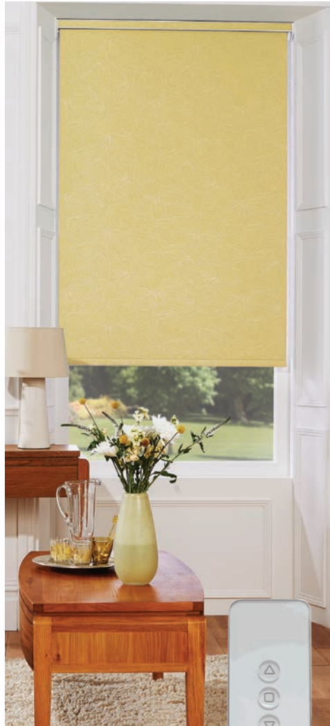
5 Channel Remote Control