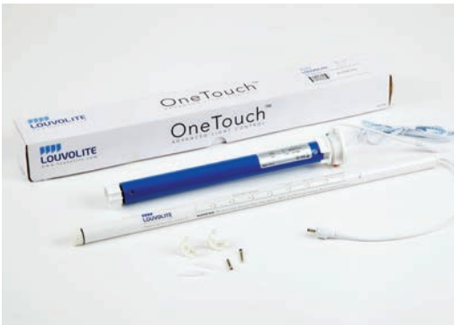
700 series motor