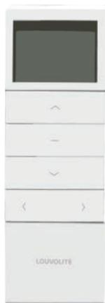
15 Channel Remote Control